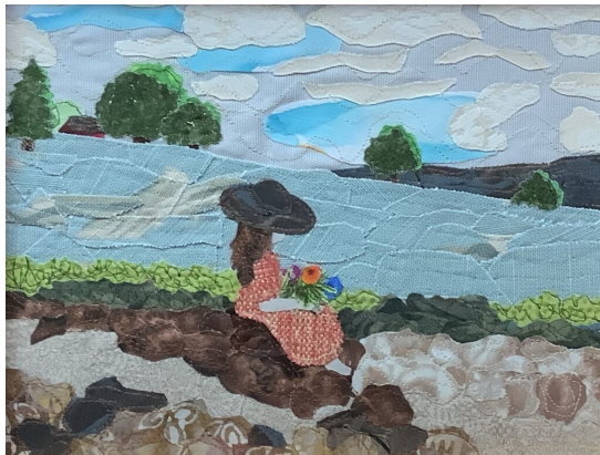
2nd PLACE Contemplating by Vivian Drawneek, Fabric Collage- 10” x 8” Inspired by Winslow Homer- “The Green Hill” -1878