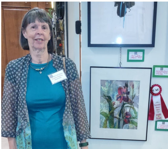
"Stained Glass Flowers" – Watercolor Collage – 16" x 20" by HEATHER DOHERTY SECOND PLACE