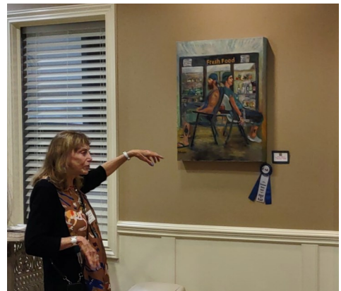
"Farm Fresh"- Acrylic – 24" x 30" by MARCELLE SCHVIMMER FIRST PLACE