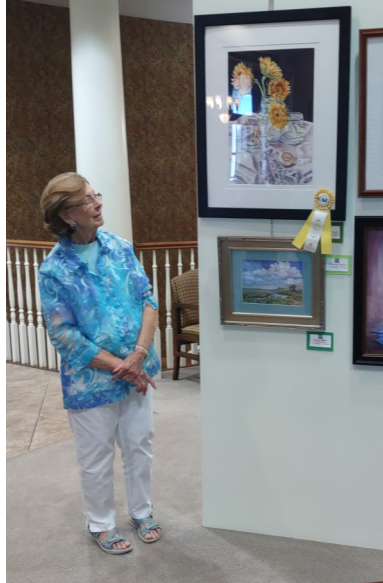
BEST OF SHOW "Golden Girls" – Watercolor 14" x 20" by BARBARA FIFE