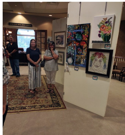
"Forever" – Mixed Medium- 24" x 36" by CATHY BURNSIDE THIRD PLACE